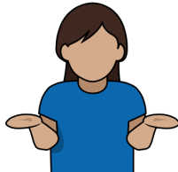
5. Accepted "Accepted"

Two fists bumped together in front of chest, back of hands facing outward