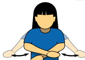
6. Retracted/Play On "Retracted" "Play On"

Forearms extended in front of body, elbows tight against torso with palms facing upwards