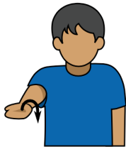
13 Turnover "Turnover"

Right arm extended in front of body, palm facing up and then rotate to palm facing down