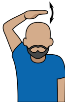
14. Timing Violation "Stall" "Violation" Tap head with open hand

Right arm extended in front of body, palm facing up and then rotate to palm facing down