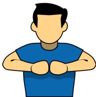
4. Contest "Contest"

Raise both arms, fully extended, straight up, palms facing inward