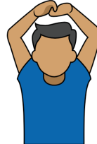
18. Stoppage "Injury" "Technical" Hands clasped and raised above head, arms bent