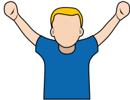
2. Violation "Violation"

Hold one arm straight out and chop the other forearm across the straight arm