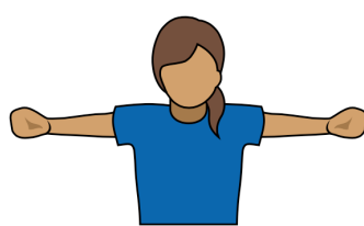
20. Personnel Ratio: Women "Ratio: Women" Arms extended to side, hands closed in a fist