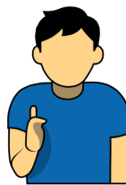
9. Disc up

Index finger straight arm pointing down at 45 degree