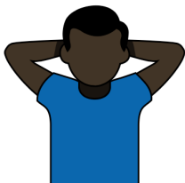
19. Personnel Ratio: Men "Ratio: Men" Hands cupped behind head, elbows out to side