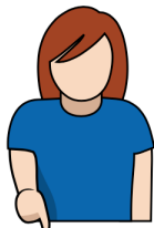
8. Disc down

Point with one arm extended, flat palm, thumb parallel to fingers, towards playing field (in) or away from playing field (out)