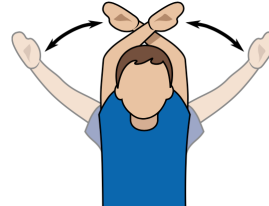
21. Play has stopped Wave both extended arms crosswise overhead