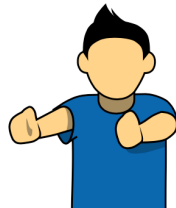
23. Who made the call "Called by Offence/Defence" Pointing with two arms straight out, towards the end zone being defended by the team