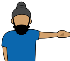
7. In/Out-of-bounds – Out of end zone "In" "Out"

Sweeping crossover motion with both arms extended down in front of body