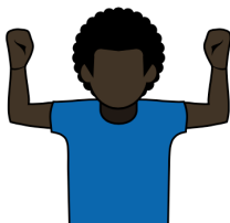
10. Pick "Pick"

Elbow down forearm vertical index finger pointing upward