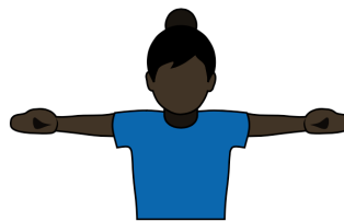
12. Marking Infraction "Fast Count" "Straddle" "Disc Space" "Wrapping" "Double Team" "Vision"

Closed fists, rotate wrists around in a vertical circle