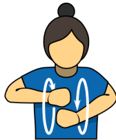
11. Travel "Travel"

Arms raised, elbows bent, fists facing head