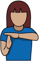
16. Time-out "Time-out"

Form a T with the hands, or a hand and the disc