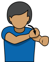
1. Foul "Foul"

Hold one arm straight out and chop the other forearm across the straight arm