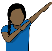
22. Match Point "Match Point" Both arms pointing straight up to the left, palms facing down