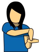
17. Spirit Stoppage "Spirit Stoppage" Upside down T formed by the hands

Form a T with the hands, or a hand and the disc