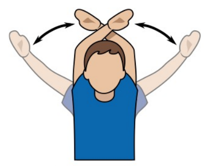
21. Play has stopped

Arms extended to side, hands closed in a fist