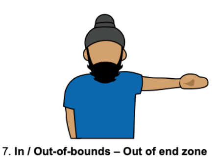
In, Out Point with one arm extended, flat palm, thumb parallel to fingers, towards playing field (in) or away from playing field (out)