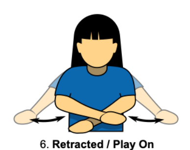
Retracted, Play On Sweeping crossover motion with both arms extended down in front of body