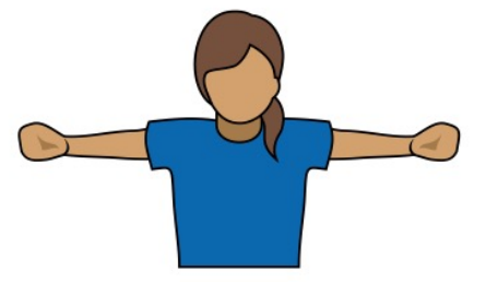
20. 3 men, 4 women

Hands cupped behind head, elbows out to side