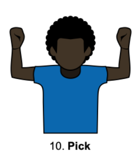
Pick Arms raised, elbows bent, fists facing head