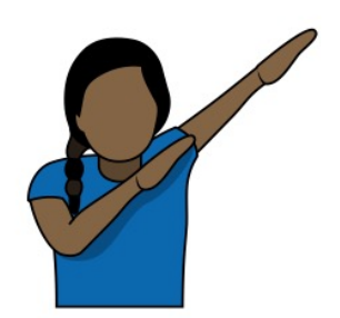
22. Match Point

Wave both extended arms crosswise overhead