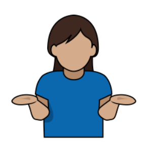
5. Uncontested Uncontested Forearms extended in front of body, elbows tight against torso with palms facing upwards